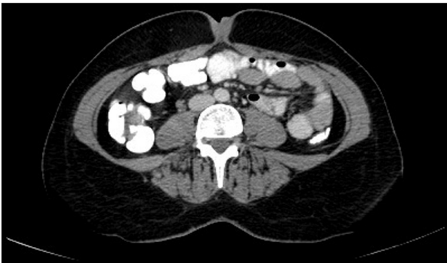
Fig. 2. An increased density in the subcutaneous tissue of umbilicus.