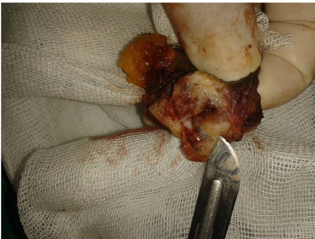
Fig. 3. Total resection of the lesion.

and she denied medical treatment. The existing lesion was totally resected with umbilicus under general anesthesia [Fig. 3]. In pre-operative abdominal tomography there was no any suspect about pelvic endometriosis. Therefore, during the operation any more invasive pelvic assessment was not be necessary. She had no complications during postoperative period. In the histopathological examination of resected tissues, a well-circumscribed endometriosis foci was identified with dilated glands localized in the deep dermis under the epidermis with stratified squamous epithelium