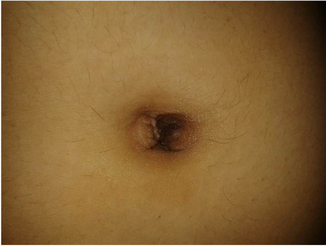
Fig. 1. A dark-color sensitive nodule of 20 × 15 mm.