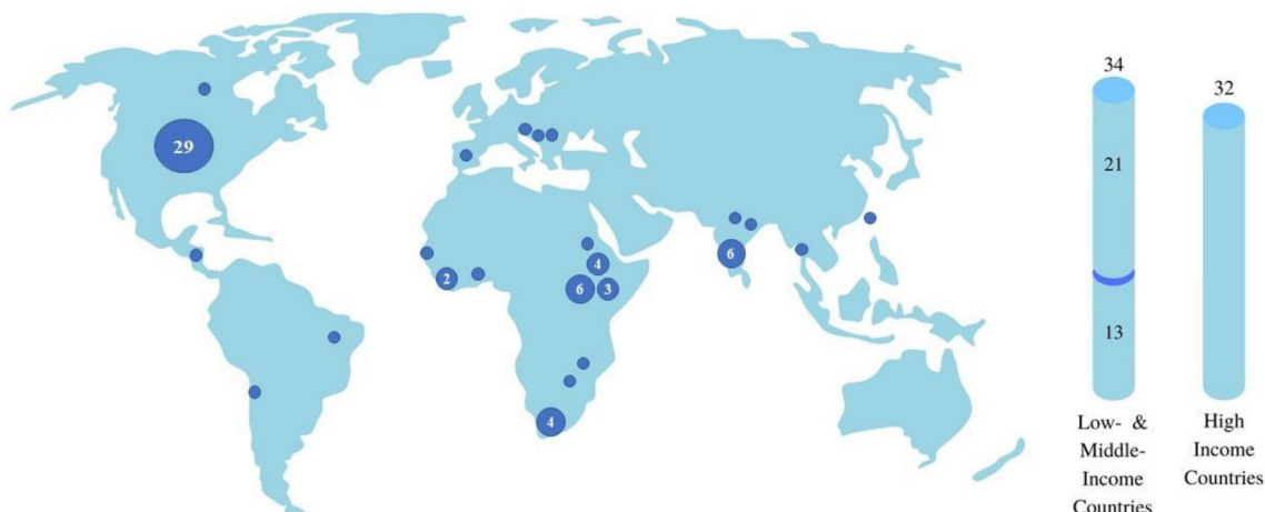
Figure 2 Country of origin and World Bank Classification for included intervention studies.

The predominance of gender-transformative interventions targeting the individual or group level was further triangulated by categorising interventions according to the COM-B model behaviour change