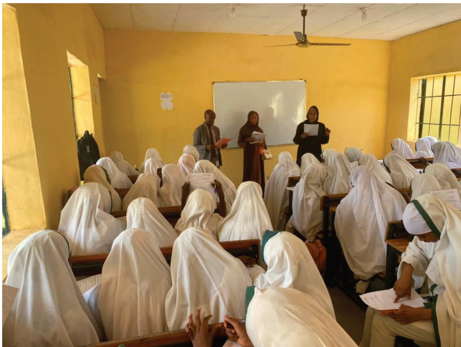
FIGURE 2: Sensitization on the health effect of HPV and cervical cancer conducted at Professor Hafsat Abdullahi Ganduje Secondary School Gyadi-Gyadi, Kano State, Nigeria.