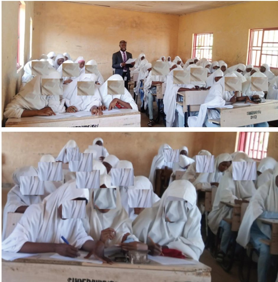
FIGURE 3: Sensitization on the health effect of HPV and cervical cancer conducted at Government Girls Secondary School Gandu, Kano State, Nigeria.